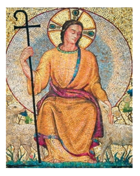
God's Word daily reflections 2024

People today, most of whom see shepherds only in movies or on television, are nonetheless moved by the comforting image of a shepherd. In times of difficulty or intense sorrow, they derive comfort from praying Psalm 23: "The Lord is my shepherd; there is nothing I shall want (v. 1). Moreover, the image of Jesus as Good Shepherd challenges religious leaders to be 'shepherds after God's own heart' and inspires the people, the 'flock', to turn to him for love and security.